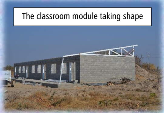
The classroom module taking shape