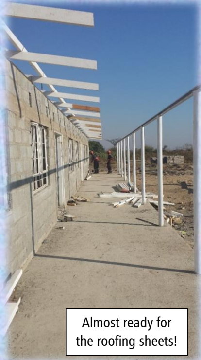
Almost ready for the roofing sheets!