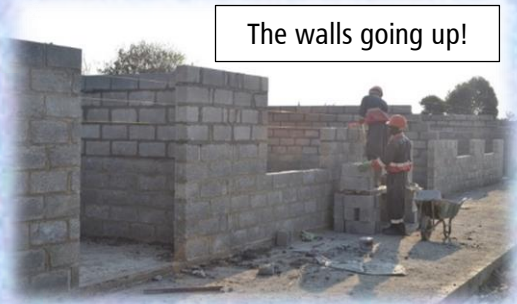
The walls going up!