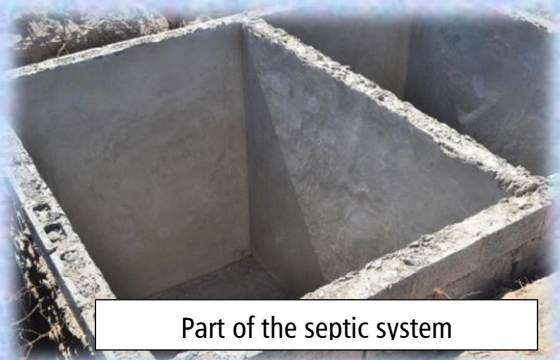
Part of the septic system