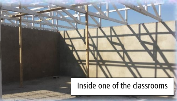
Inside one of the classrooms