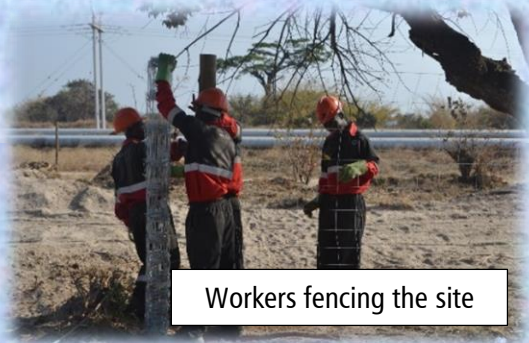
Workers fencing the site