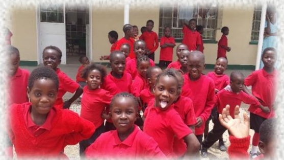
Much excitement over the new uniforms (some still with tags on!) – and this year a first – dresses for the girls (instead of skirts and shirts).