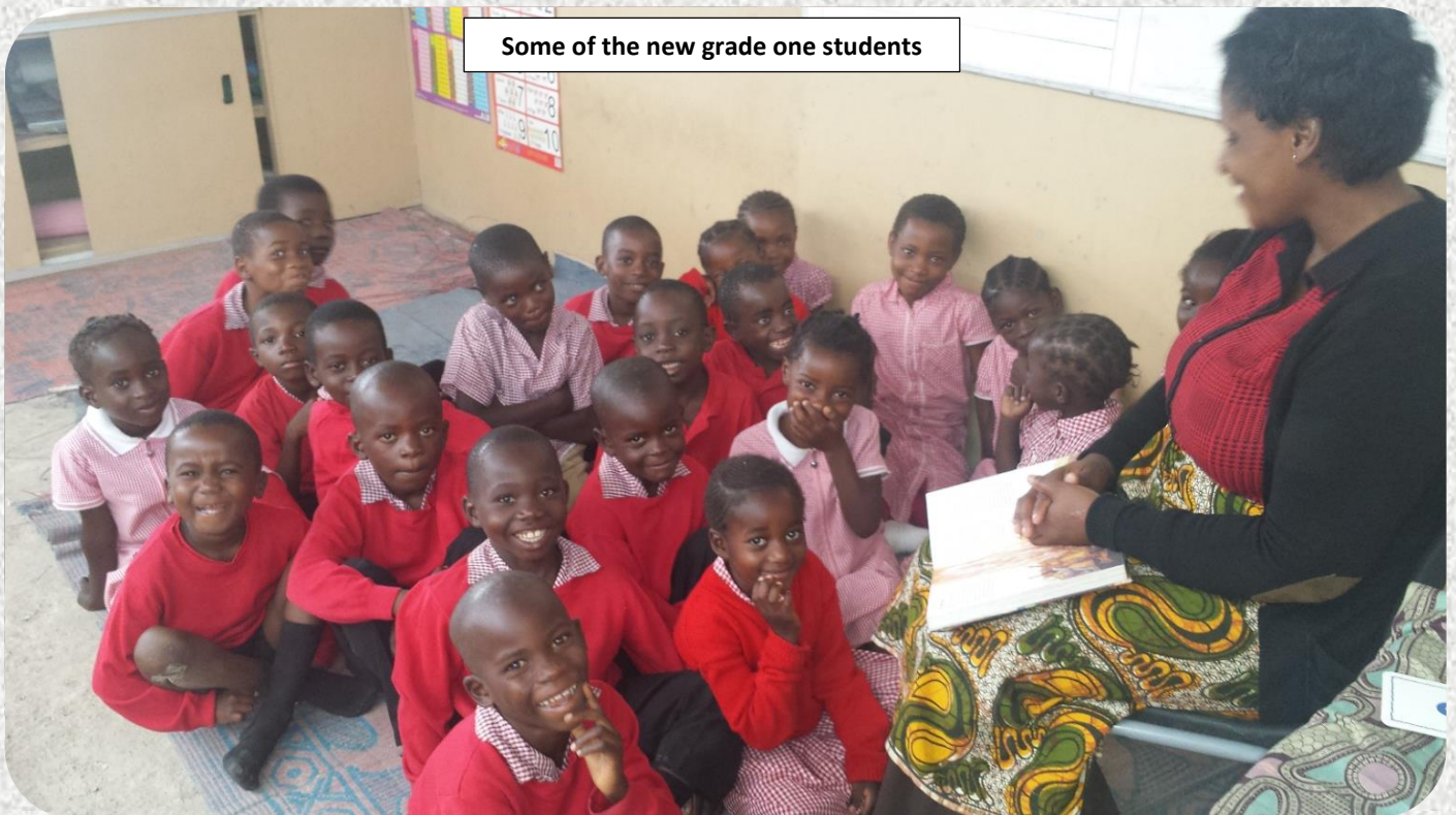
Some of the new grade one students

A NEW YEAR After a dedication service and working bee on 8 th January, school officially opened on Monday, 11th January, 2016. Thirty one bright, happy faces hopped off the school bus, full of expectation and excitement about their new school; and ninety returning students arrived filled with anticipation and ready to learn. New parents have joined the cooking roster, and school maintenance is currently being carried out: the recent heavy rains have resulted in very long grass, which needs to be cut.