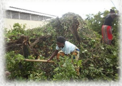
Above: school gardening and maintenance and our first yield of home grown tomatoes which are being used in school lunches.