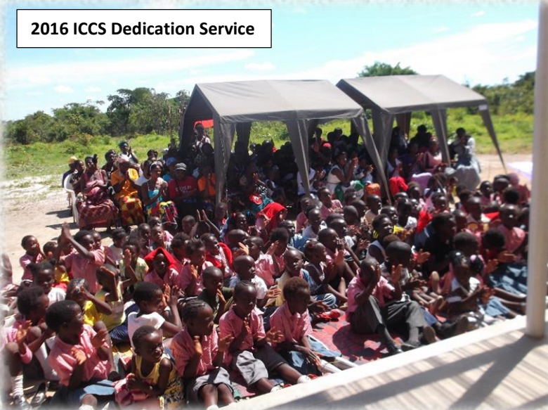
2016 ICCS Dedication Service