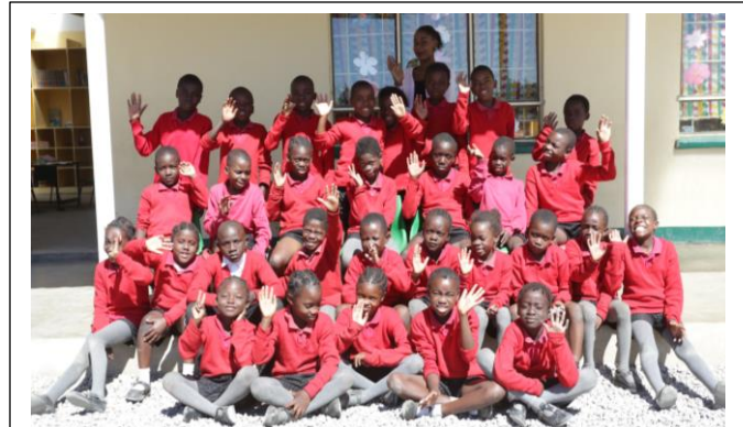
Grade Three students outside their classroom