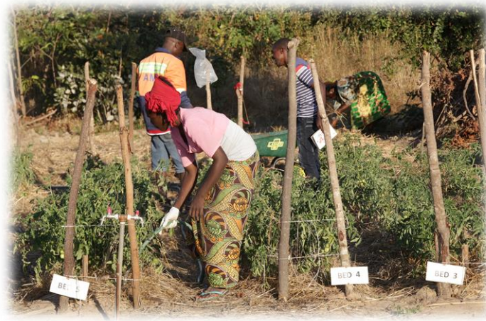
Our women and staff hard at work in the school gardens.

The school gardens are continuing to be developed as we are starting to grow vegetables for the student lunches. A recent donation from a Sydney art group enabled us to purchase fertiliser, banana saplings, and other vegetable seedlings to increase our produce.