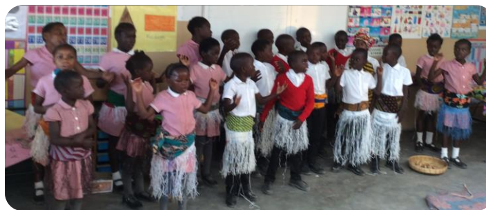
Grade 2 class during their assembly month, entertaining the school with their cultural dancing

Children continue to entertain the staff and their fellow students at the monthly ICCS school assemblies.