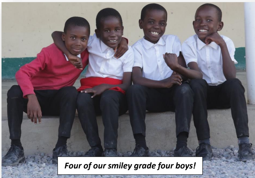
Four of our smiley grade four boys!