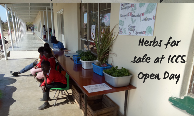
Herbs for sale at ICCS Open Day

We sold second-hand clothing, women's crafts and jewellery, hot food and drinks, and vegetables grown on the school premises. Approximately $1,500 was raised from the Open Day, including related donations. We had Mim and Tim from Australia visiting last week. They have been taking photos, videos and drone footage of all the school activities (some of which are in this newsletter). They leave today for a much needed short holiday after a whirlwind week.