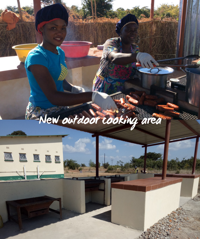
New outdoor cooking area