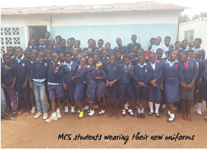
MCS students wearing their new uniforms