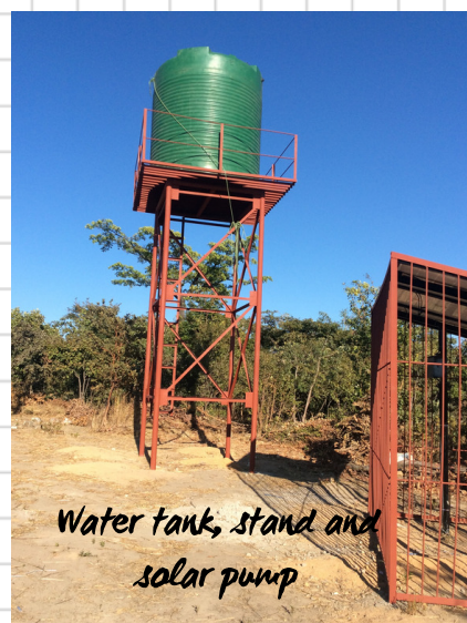
Water tank, stand and solar pump