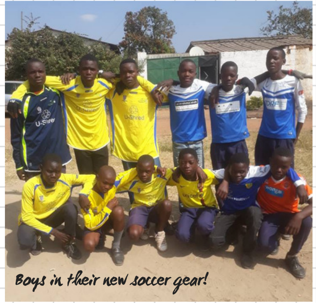
Boys in their new soccer gear!