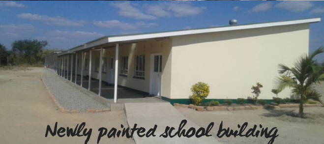
Newly painted school building