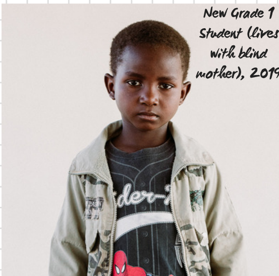
New Grade 1 Student (lives with blind mother), 2019