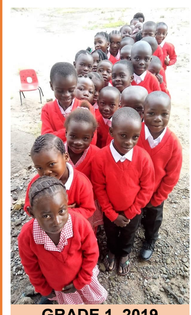
GRADE 1, 2019