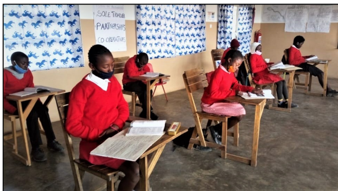
Grade 7 at work