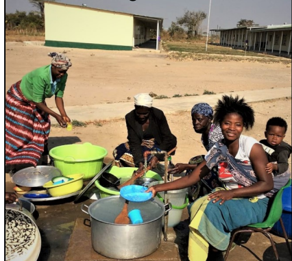
Parents washing dishes after lunch

It is not yet clear when normal school lessons will resume for non-examination classes, but for now we pray for the best, and apply the most effective means to keep students in tune with education.