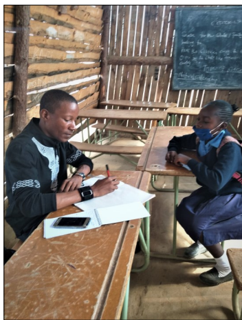
Katonga collecting info for Grade 7 Database