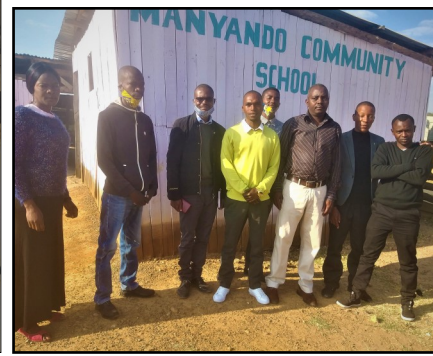
2nd ICCS Team at MCS