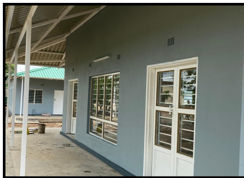
The new Boarding house almost finished!