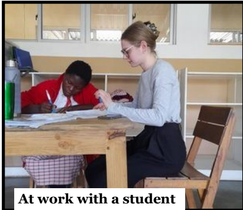
At work with a student