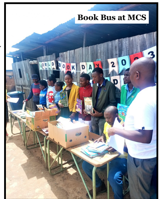
Book Bus at MCS

The school received visitors from Book Bus in the United Kingdom. Book Bus Zambia has been a partner of the school for over ten years. Their support has been focused on improving and encouraging reading among learners in the school. The support has involved both materials and capacity building.