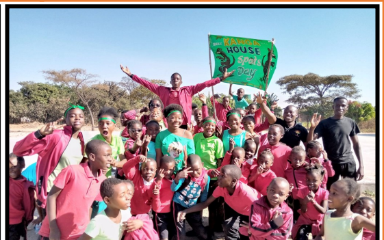
Inter house sports day