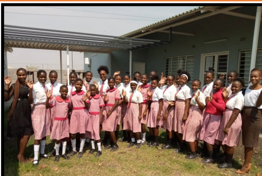
24 ICS Boarders with house matrons

A significant way to make a difference in the lives of vulnerable children is by making a Charitable Bequest in your Will. A lasting donation of a Bequest to Zambia's Child would contribute to the betterment of Ipalo Christian School (ICS), and enhance the education of many children living in poverty. Perhaps you might discuss this with your Executor?