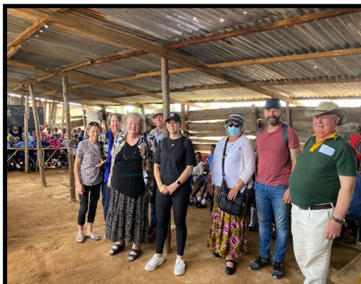
Zambia's Child team visiting MCS