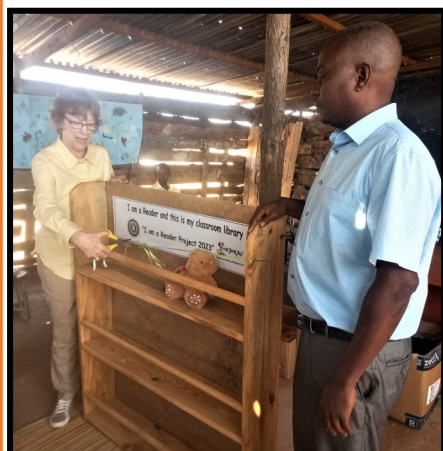
Book Bus visitors from the UK