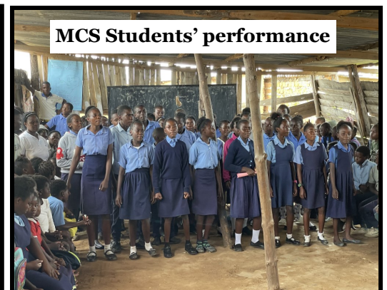
MCS Students' performance