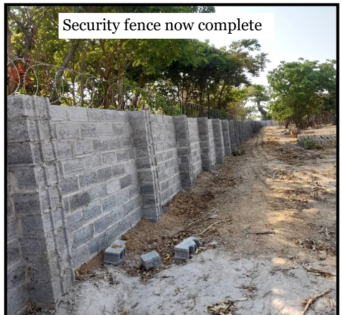
Security fence now complete