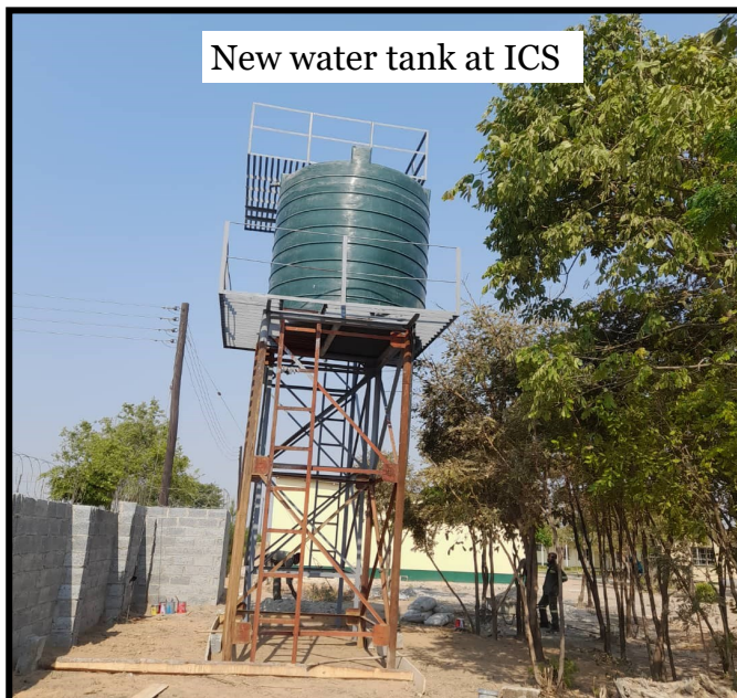
New water tank at ICS