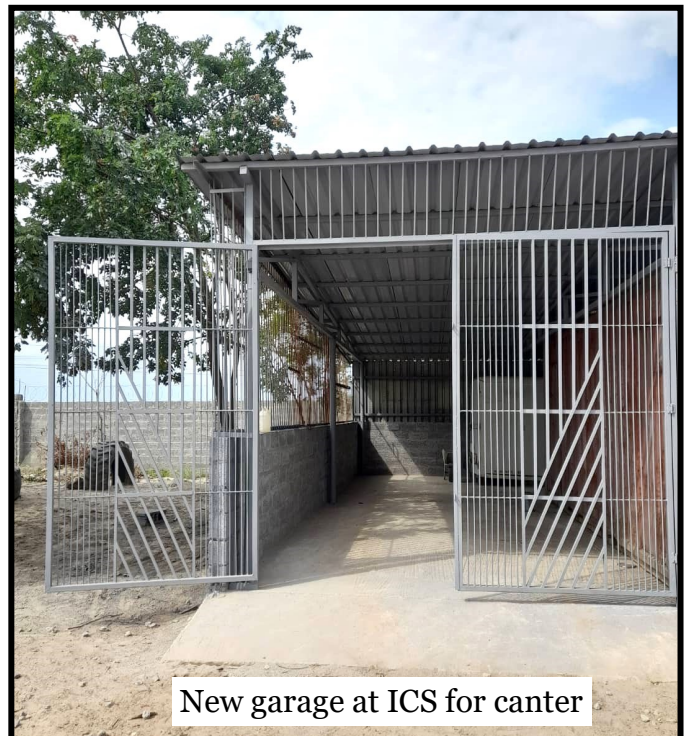
New garage at ICS for canter

Merry Christmas to everyone as we reflect on Jesus' birth and what this means in our lives.