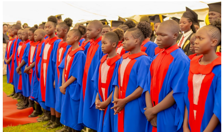
Below: Grade 7 Graduates, Bottom R: Grade 12 Graduating Class, Bottom L: New Boarding House for Boys